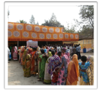
The line for one of the traveling clinics in India

In the future, I hope to also create a medical database that will allow the clinic to track year-to-year patient histories. Perhaps one day I'll be able to build decision support systems for other clinics and hospitals in GOM too.