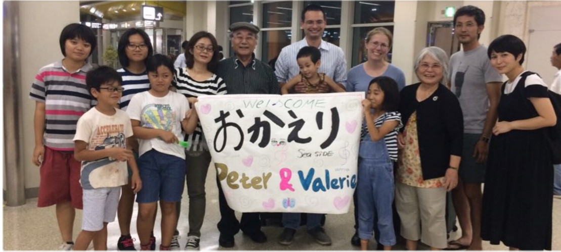
Our friends, welcoming us at the airport in Okinawa.