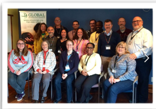
Our fellow missionaries, at GOM training.