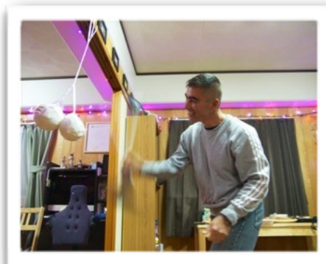
Everyone was in on the action.