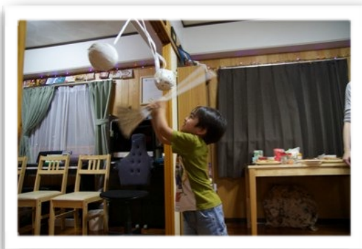
Snowman piñata for our Christmas party.