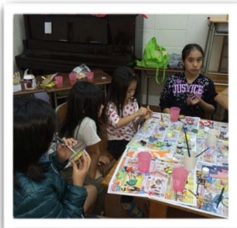
Christmas ESL class, making dough ornaments.