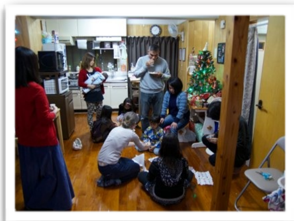
Making paper snowflakes.