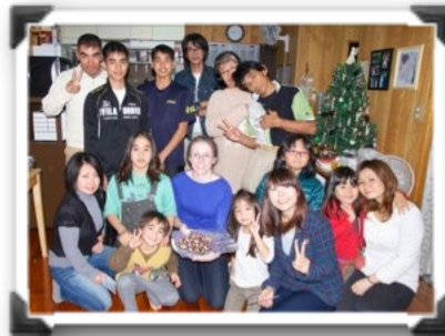
Christmas baking club.

To end the season, after our grand finale Christmas ESL class party, we hosted a