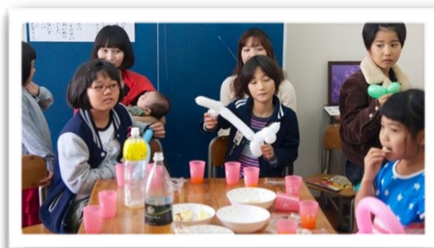
At the end of each class we enjoy snack time together!