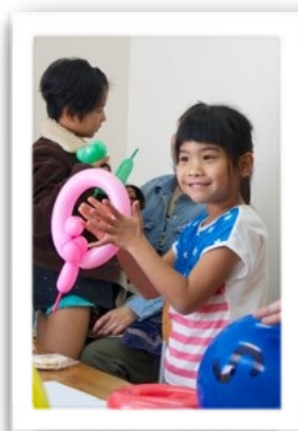
We give each child a balloon animal.