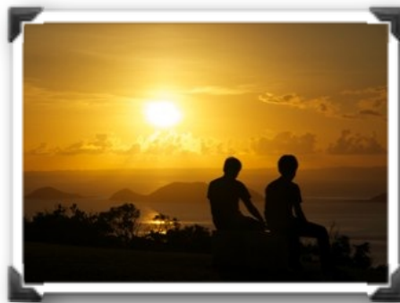
Two boys at summer camp (2013).

Hanna and several of the other ESL girls have begun coming to the church mid-week after school to play in the parking lot, mess around with the church's drum