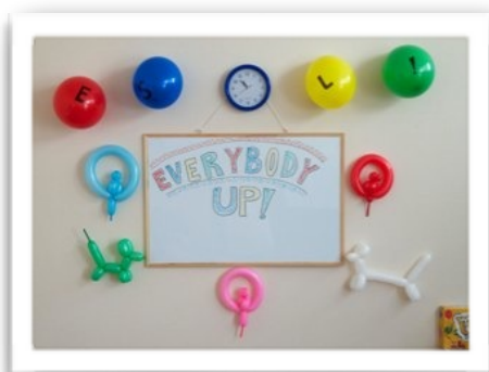
Decorating the classroom for Kids' ESL.