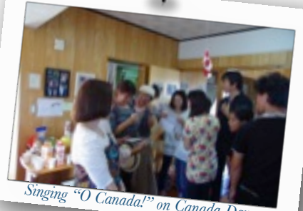
Singing "O Canada!" on Canada Day.