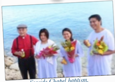
Seaside Chapel baptism.