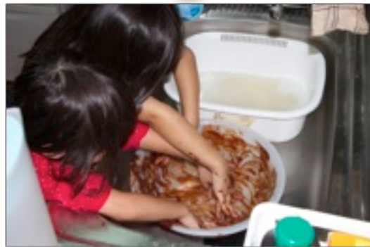
Licking the bowl clean after Christmas baking with our friends.

NOTE: If you have an egg sensitivity or allergy, this recipe works well without the eggs. The pie will just be a little less moist.