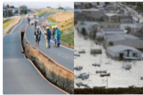
Left: A caved-in road in Saitte (Saitama Prefecture) Right: The submerged port in Oarai (Ibaraki Prefecture)

Okinawa, though a small island, is sufficiently distant from the rest of Japan that it was lightly affected by the various disasters. For instance, it didn't even feel the earthquake, and the tsunami that it experienced was minimal. The main effect that we will likely see, when we arrive in September, is that there will be lots of displaced people who have come to Okinawa. More than 1/2 million people have lost their homes. The government has opened up public