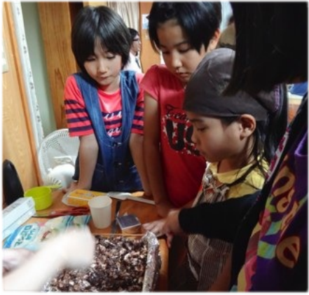
Making dessert. Everyone loves chocolate!