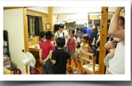
Packed house for Yaku Yaku Cooking Club.