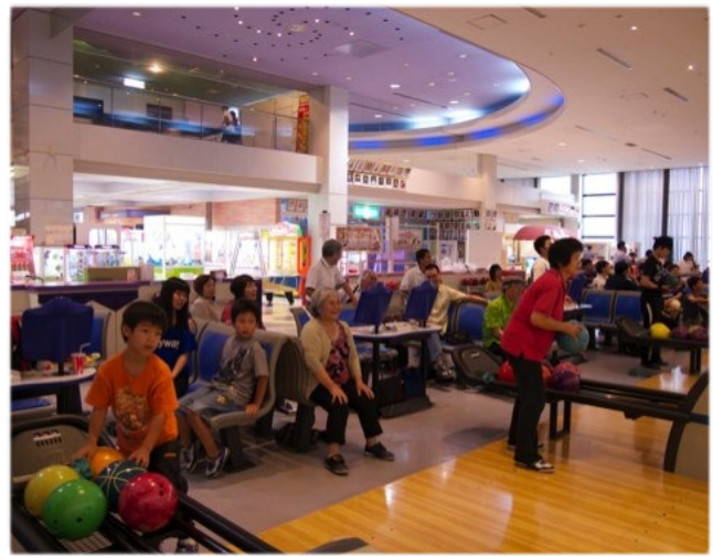
Almost everyone from the church came... and so did some other friends and family!