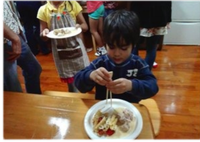
Time to eat our cooking.