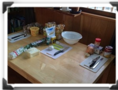
Everything is ready for cooking club...

Since the World Cup will be taking place in June, I'm planning to centre this month's Yaku Yaku around foods that