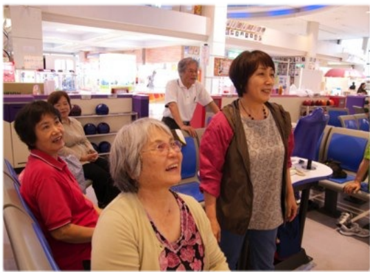
Checking out the scores.