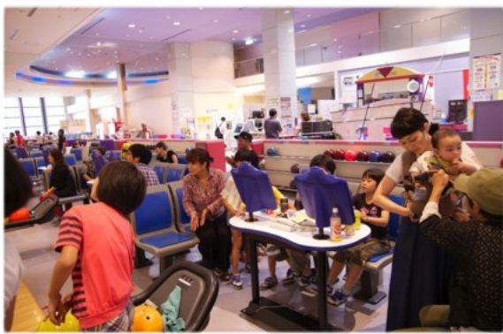
Church family bowling event.