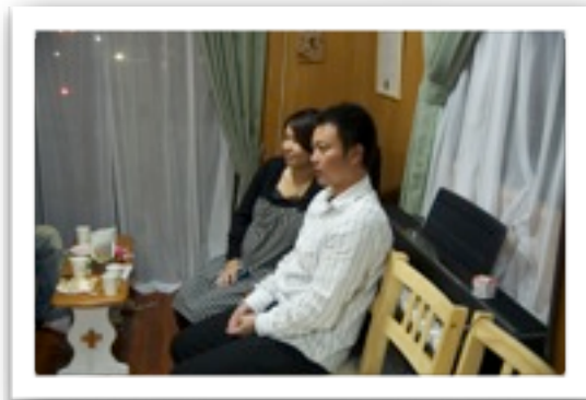
Our downstairs neighbours came!