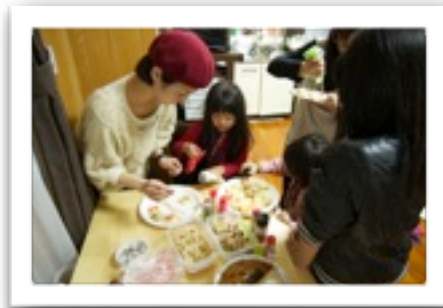
Decorating sugar cookies.