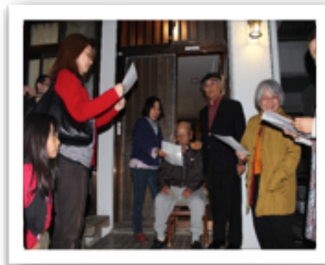
Caroling at a shut-in church member's house.