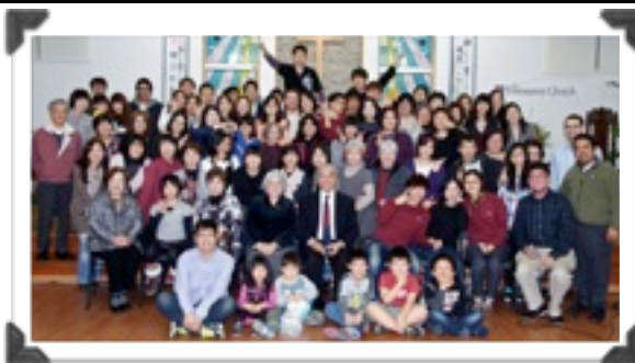
Korea Night with Campus Crusade for Christ.

We ended up talking with them for more than 45 minutes. We've since seen a couple of them in the park again, and hope that if we're able to stay in Okinawa