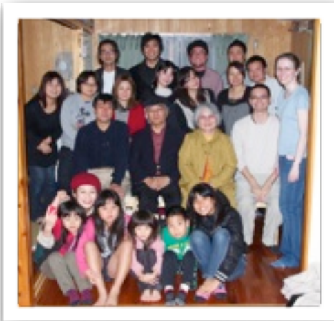
Our Christmas party guests.