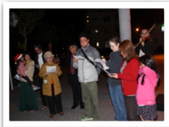
Caroling in the neighbourhood... it was a frigid 18C! (Some came back to our house later for hot chocolate...)