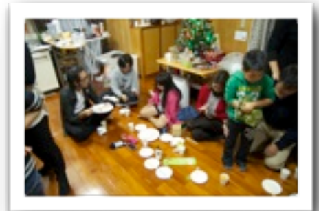
Christmas party, Japanese-style!!