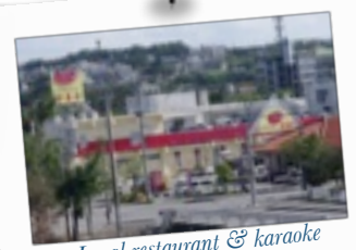
Local restaurant & karaoke