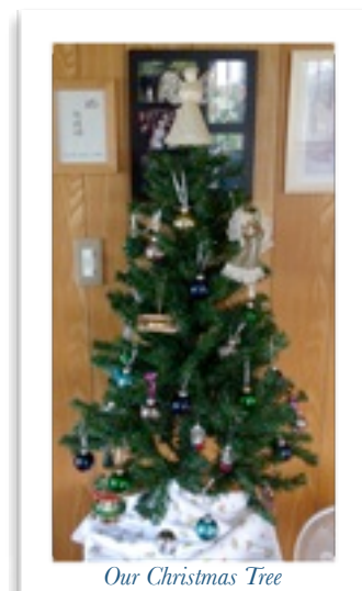
Our Christmas Tree

Note: For richer cookies, substitute in whole wheat flour.