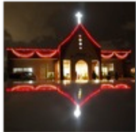
Seaside Chapel, decorated

It's Christmas time again and in our imaginations Christmas trees and decorations are already up in your homes, houses are festooned with multicolored lights, and hopeful stores are pumping smells of turkey and stuffing into the corridors of busy shopping malls. It's a very different story here. In Japan, Christmas is a curiosity but many don't know of its origins and traditions.